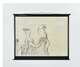
Cegueira [Blindness] , 2024 Acrylic and felt tip pen on screen 41 7/8 x 52 1/8 x 1 5/8 in. (106.5 x 132.5 x 4 cm) (29699)