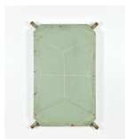
Nude , c. 1980 Incisions and roller ball pen on wood 21 5/8 x 14 x 1 3/4 in. (55 x 35.5 x 4.5 cm) (29694)