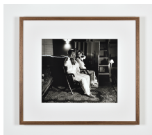
Artiste plastifié , 1981-2025 Silver gelatin print on baryta paper, acrylic paint Image: 9 1/2 x 11 3/8 in. (24 x 29 cm) Paper: 11 3/4 x 15 in. (30 x 38 cm) Frame: 15 7/8 x 17 5/8 x 1 1/4 in. (40.3 x 44.7 x 3.3 cm) (29690)