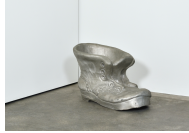
Zambujeira do Mar , 2000

35 1/4 x 4 1/8 x 1 1/8 in. (89.5 x 10.5 x 3 cm) (29695)