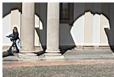
Arches, Milan, 2024 UV-curable ink on Dibond aluminum 42 x 63 3/8 x 1 7/8 in. (106.6 x 161 x 4.8 cm) Edition of 5 plus 2 artist's proofs (29420)