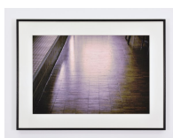
9567, Maison de verre, 2009 Inkjet print on Museo Max paper Image: 19 7/8 x 29 1/2 in. (50.5 x 75 cm) Frame: 28 x 37 3/4 x 1 3/4 in. (71 x 96 x 4.5 cm) Edition of 3 plus 2 artist's proofs (18289)