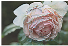
Rose 2, Rome, 2024 UV-curable ink on Dibond aluminum 28 x 42 x 1 5/8 in. (71.1 x 106.8 x 4.1 cm) Edition of 5 plus 2 artist's proofs (29418)