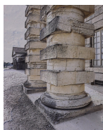
The Royal Salt-Works of Arc-et-Senans, 1775-78, Claude-Nicolas Ledoux, 1988/2023 UV-curable ink on Dibond aluminum 63 3/8 x 42 x 1 7/8 in. (161 x 106.6 x 4.8 cm) Edition of 5 plus 2 artist's proofs (29384)