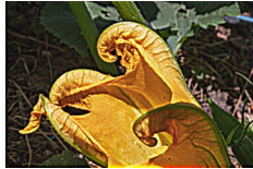
Zucchini Flower, Rome, 2024 UV-curable ink on Dibond aluminum 28 x 42 x 1 5/8 in. (71.1 x 106.8 x 4.1 cm) Edition of 5 plus 2 artist's proofs (29419)