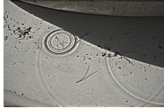
Fountain, Rome, 2024 UV-curable ink on Dibond aluminum 42 x 63 3/8 x 1 7/8 in. (106.6 x 161 x 4.8 cm) Edition of 5 plus 2 artist's proofs (29424)