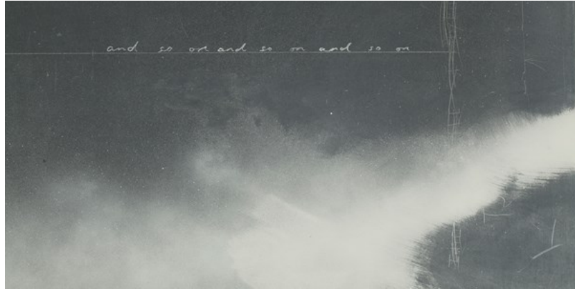
Tacita Dean "...my English breath in foreign clouds" March 2- April 23, 2016