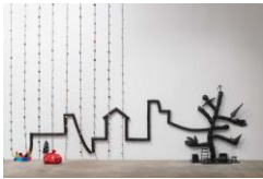
Arbre architecture, 2009 Tree architecture, skai, ropes 53 1/8 x 26 x 163 3/8 in. (135 x 66 x 415 cm) [13847]