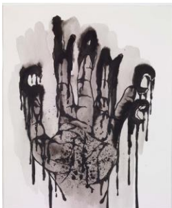
Chance , 2012 Indian ink on paper 13 3/8 x 11 1/4 in. (34 x 28.5 cm) [13832]