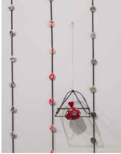
Red pouch with pin badges in cage (Ballot badge rouge en cate), 2009 Fabric, pin badges with B&W photos, metal string, metal 23 5/8 x 7 7/8 x 7 7/8 in. (60 x 20 x 20 cm) [13844]