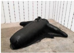
Christic figure and miniature bed with badges pinned onto a red bundle, 2009 leatherette element, net fabric, badges pinned onto a red bundle, B&W photos [13788]