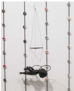
One figurine (Une figurine) , 2009 1 element, skai, metal, metal string 30 3/4 x 14 5/8 x 10 5/8 in. (78 x 37 x 27 cm) [13842]