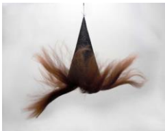
The Hat (Le Chapeau) , 2012 Mixed media, fan 25 5/8 x 12 5/8 in. (65 x 32 cm) [13734]