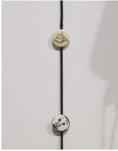
Ropes with pin badges (Cordes badgees) , 2007-2009 51 ropes, 300 cm each, 20 pin badges 118 1/8 x 496 1/8 in. (300 x 1260 cm) [13839]