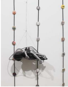
Two figurines (Deux figurines), 2009 2 elements, skai, metal, effect fabric, metal string 24 3/4 x 15 x 7 1/2 in. (63 x 38 x 19 cm) [13841]