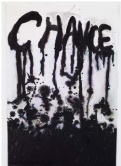
Chance , 2012 Indian ink on paper 11 1/2 x 8 1/8 in. (29.3 x 20.5 cm) [13834]