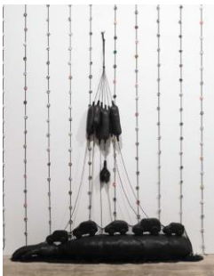
Arm, cars (Bras/voitures) , 2009 7 elements in skai with 5 car shaped elements, 1 arm shaped element, skai, net ropes 97 5/8 x 78 3/4 x 19 5/8 in. (248 x 200 x 50 cm) [13840]