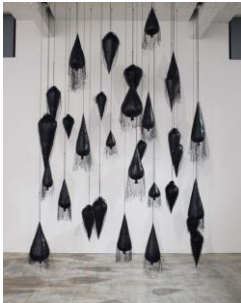
Black cones (Cones noirs), 2009 Ca 30 elements, skai, net, ropes 15 3/4 x 102 3/8 x 86 5/8 in. (40 x 260 x 220 cm) [13849]