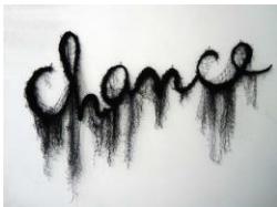
Chance , 2011-2012 Mesh fabric 55 1/8 x 78 3/4 in. (140 x 200 cm) [13733]