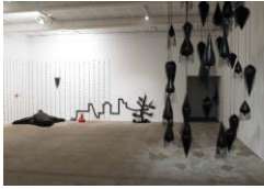
And clean up your room , 2007-2009 Installation, mixed media [13838]