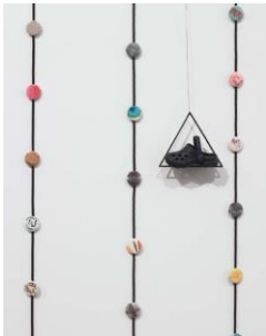
Shoes into iron triangle (Chassure dans triangle), 2009 2009 Rubber, metal, metal string 19 1/4 x 6 1/4 x 2 3/4 in. (49 x 16 x 7 cm) [13843]