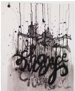
Chance , 2012 Indian ink on paper 24 5/8 x 20 1/2 in. (62.4 x 52 cm) [13830]