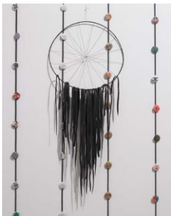
Fringed circle (Cercle frange) , 2009 metal, rubber 39 3/8 x 15 3/4 x 3 7/8 in. (100 x 40 x 10 cm) [13845]