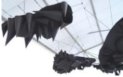
Black Continents (Continents noirs) , 2012 Installation, 19 elements, mixed media variable dimensions [13789]