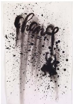
Chance , 2012 Indian ink on paper 20 1/4 x 13 1/4 in. (51.3 x 33.5 cm) [13831]