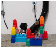
Bundle into Lego (Ballot dans lego), 2009 fabric, pin badges 7 7/8 x 11 3/4 x 11 3/4 in. (20 x 30 x 30 cm) [13846]