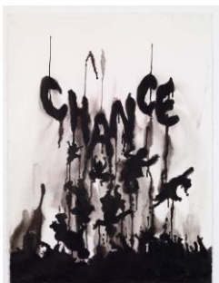
Chance , 2012 Indian ink on paper 30 x 22 5/8 in. (76.2 x 57.5 cm) [13833]