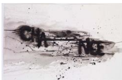
Chance , 2012 Indian ink on paper 19 1/2 x 30 in. (49.5 x 76.2 cm) [13836]