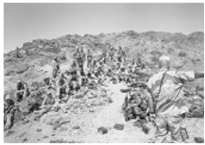
Infantry Officers' Brief , from 29 Palms , 2003-2004 Gelatin silver print Image: 37 1/2 x 26 in. (95.3 x 66 cm) Frame: 38 1/4 x 26 3/4 in. (97.2 x 67.9 cm) Edition of 5 + 2 APs No. 19912