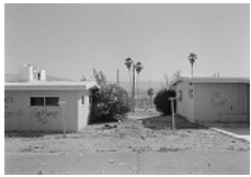
Security and Stabilization Operations, Graffiti (GI Go Home) , from 29 Palms , 2003-2004 Gelatin silver print Image: 37 1/2 x 26 in. (95.3 x 66 cm) Frame: 38 1/4 x 26 3/4 in. (97.2 x 67.9 cm) Edition of 5 + 2 APs No. 19917