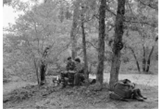
Lesson , from Small Wars , 1999-2002 Gelatin silver print Image: 37 1/2 x 26 in. (95.3 x 66 cm) Frame: 38 1/4 x 26 3/4 in. (97.2 x 67.9 cm) Edition of 5 + 2 APs No. 19906