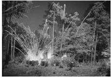
Explosion , from Small Wars , 1999-2002 Gelatin silver print Image: 37 1/2 x 26 in. (95.3 x 66 cm) Frame: 38 1/4 x 26 3/4 in. (97.2 x 67.9 cm) Edition of 5 + 2 APs No. 19907