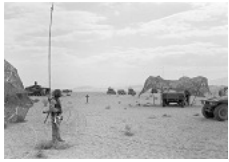
Combat Operations Center Guard , from 29 Palms , 2003-2004 Gelatin silver print Image: 37 1/2 x 26 in. (95.3 x 66 cm) Frame: 38 1/4 x 26 3/4 in. (97.2 x 67.9 cm) Edition of 5 + 2 APs No. 19911