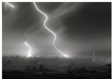
Night Operations I , from 29 Palms , 2003-2004 Gelatin silver print Image: 37 1/2 x 26 in. (95.3 x 66 cm) Frame: 38 1/4 x 26 3/4 in. (97.2 x 67.9 cm) Edition of 5 + 2 APs No. 19920