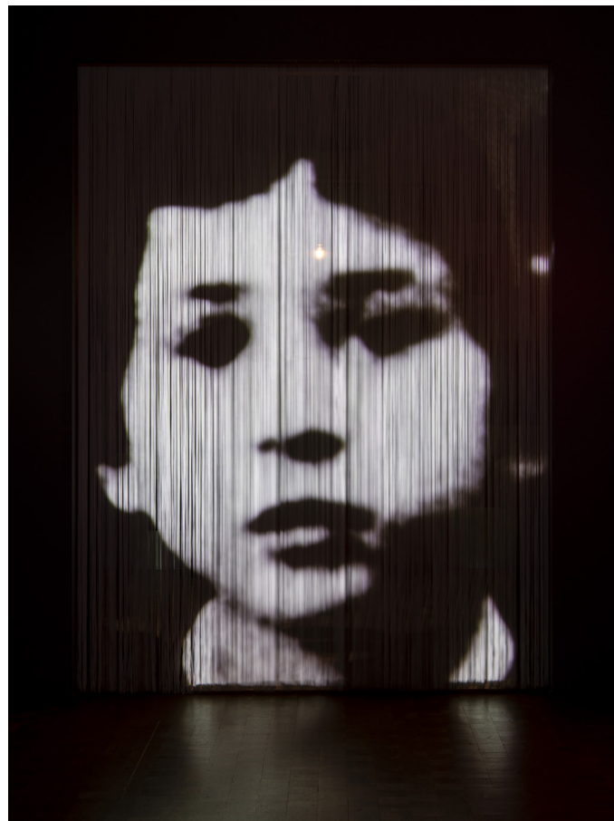
Christian Boltanski, Entre-temps, 2003 Video projection, black and white, 1min. 37 sec., silent, video projector, rope curtain, Courtesy Christian Boltanski studio and Marian Goodman Gallery

Joined together for the first time, the four institutions thus wished to invite the public to remember. To remember, as the artist always endeavoured to do, in order to combat finitude and forgetting, reconstituting the lives of beings with all their “small memories” in order to sketch a fragile and disturbing form of the collective memory of humanity.