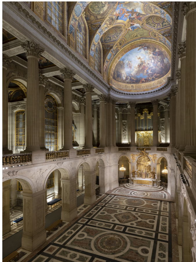
La Chapelle Royale

"It's a parable. To be human is to fight against God – or chance, depending on the name you give it – but there is one domain where we will always lose: time" – C.B.