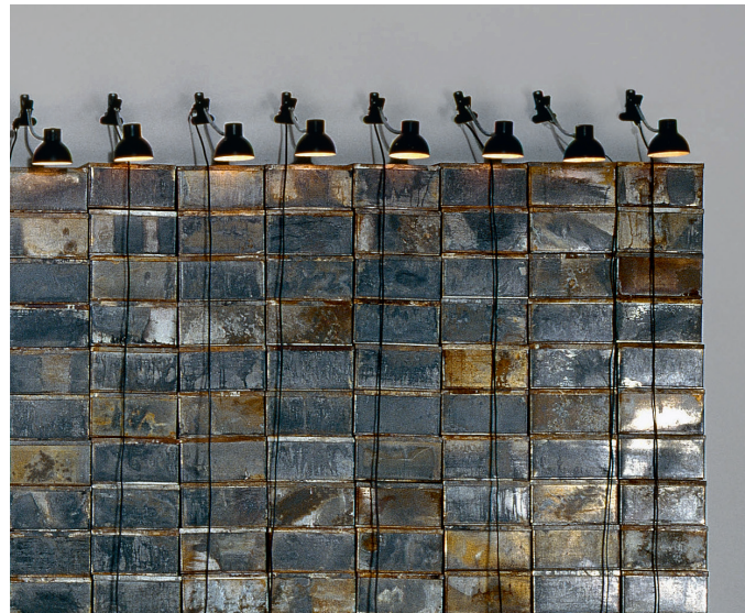
Les Archives de Christian Boltanski, 1965-1988, 1989 Metal, lamps, electric wires, black and white and colour photographs, paper